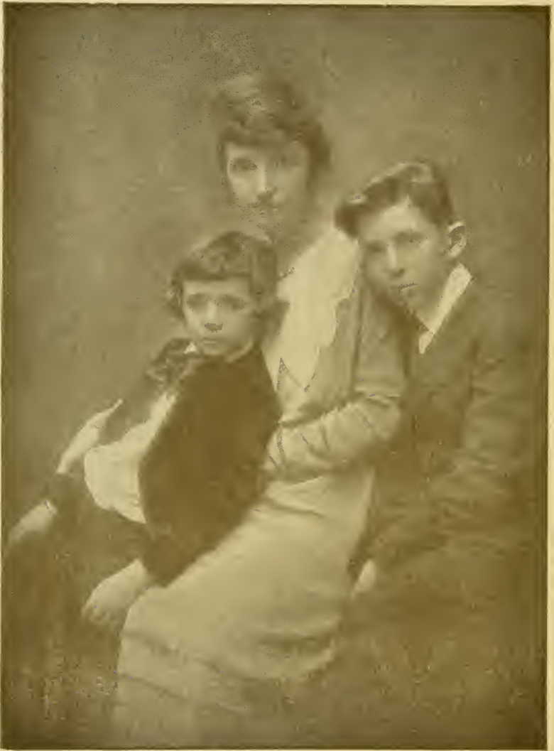
THE AUTHOR AND HER SONS